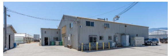
DRYING & TRIM