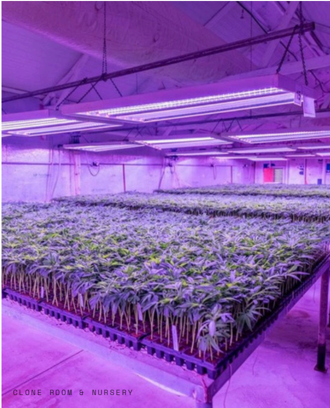
CLONE ROOM & NURSERY